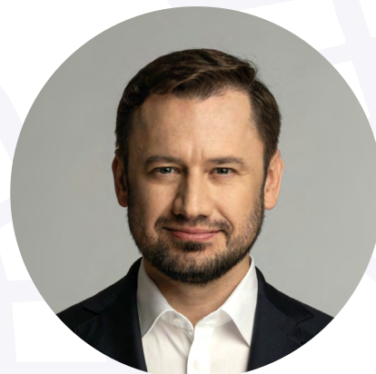
Aleksander Miszalski Mayor of the City of Krakow