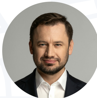
Aleksander Miszański Mayor of the City of Krakow