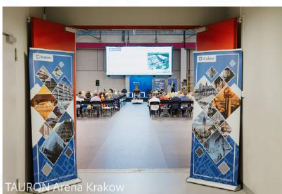
TAURON Arena Krakow