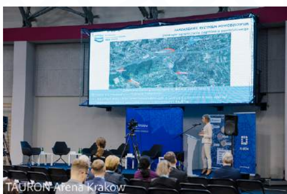
TAURON Arena Krakow

Extensive video reports and speaker presentations are available on our website.