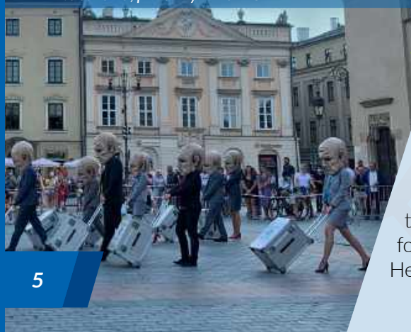
Teatr KTO, Peregrinus, Krakow Main Square, 11.08.2020

RESILIENT CULTURE is cooperation, solidarity, mutual reinforcement and dialogue in the sphere of culture.