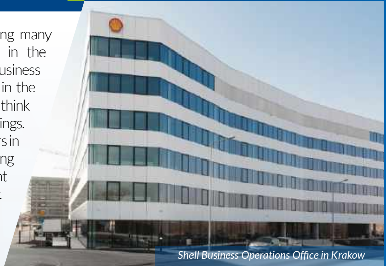
Shell Business Operations Office in Krakow

They employ more than 4,000 employees, including many residents of Krakow. They have been involved in the sustainable development of the city for years - Shell Business Operations Krakow is not only a leading employer in the Malopolska Region, but also a place where people think about the future of themselves and their surroundings. SBO Krakow is one of the five Shell operational centers in the world. Since 2006, it has been gradually increasing its international role, contributing to the development of Krakow as a leading European business center. SBO employees actively support the city in its efforts to improve air quality and protect the environment, promoting attitudes that support sustainable development.